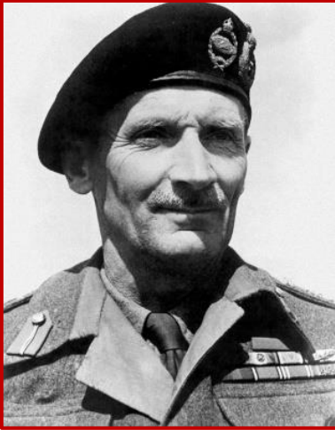
The "Real Monty" Field Marshal Montgomery in 1943.