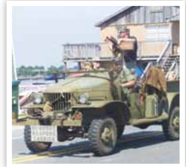
A Humvee and a WWII weapons Carrier parade down HWY 98 in Carrabelle.