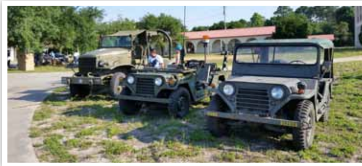
A WWII vehicle line-up in downtown Carrabelle after the parade.