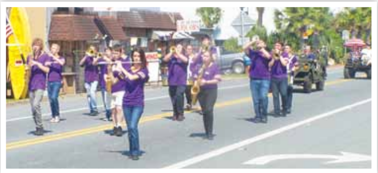
Honor Guards: The Port St. Joe Jr. Naval ROTC led the parade, followed by the Ricards Jr. Army ROTC and next came the Port St. Joe HS Band.