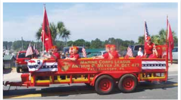
The Marine Corps League returned again this year with their entry.