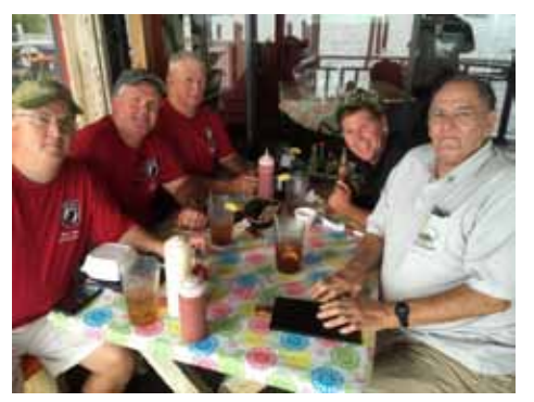
Enjoying Franklin County seafood