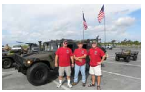
MVPA Members gather around