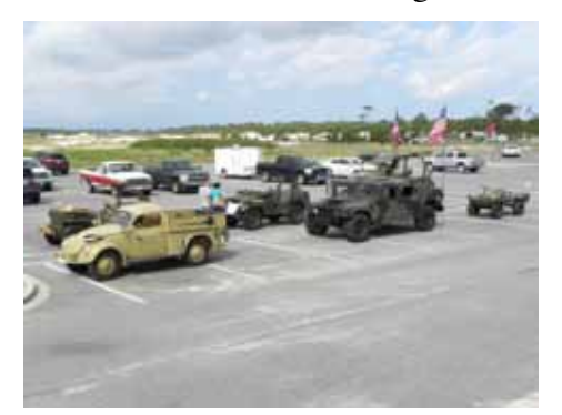
The array of vehicles